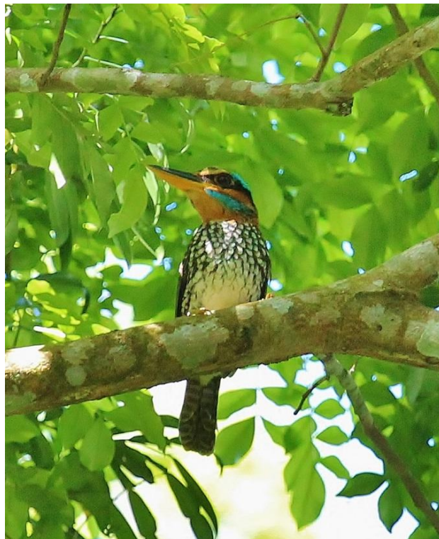
A beautiful male Spotted Kingfisher at Mount Makiling

March 14, Day 14: Bacolod to Gawahon Eco-park. Afternoon drive to Dumaguete. Our morning destination is Gawahon Ecopark. This forest site will give us the chance to look for several rare endemics—the elusive Southern Indigo-banded Kingfisher, Negros Jungle-Flycatcher, Flame-templed Babbler and if time permits Visayan Shama. They are all low density, inconspicuous species so hopefully we will have some success. In between the rarer species, we hope to see White-vented Whistler, Visayan Tailorbird, Visayan Bulbul, Lemon-throated Leaf-warbler, Visayan Fantail, Black-belted Flowerpecker and Magnificent Sunbird. Mention should be made of the distinctive white-bellied subspecies mirabilis of Balicassiao here—a good chance for a split! In the afternoon we will make the four-hour drive to the south-east to the town of Dumaguete.