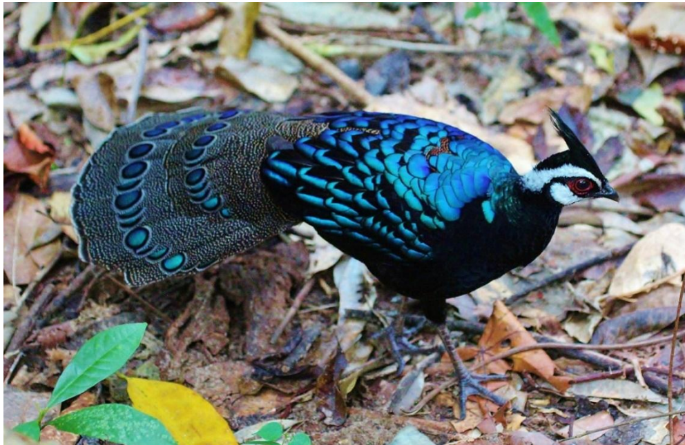
A male Palawan Peacock-Pheasant

March 1-2, Days 1-2: Departure from Home; Arrival in Manila. Most flights connecting from North America will arrive at Manila's Ninoy Aquino International Airport (airport code MNL) one or two days following your departure due to flight time and crossing the International Date Line. You will be met upon arrival by a representative of our ground agent and escorted to our hotel. We recommend flying in a day early due to potential misconnects and weather-related flight delays. The group will assemble at 7:00 p.m. on the evening of March 2.